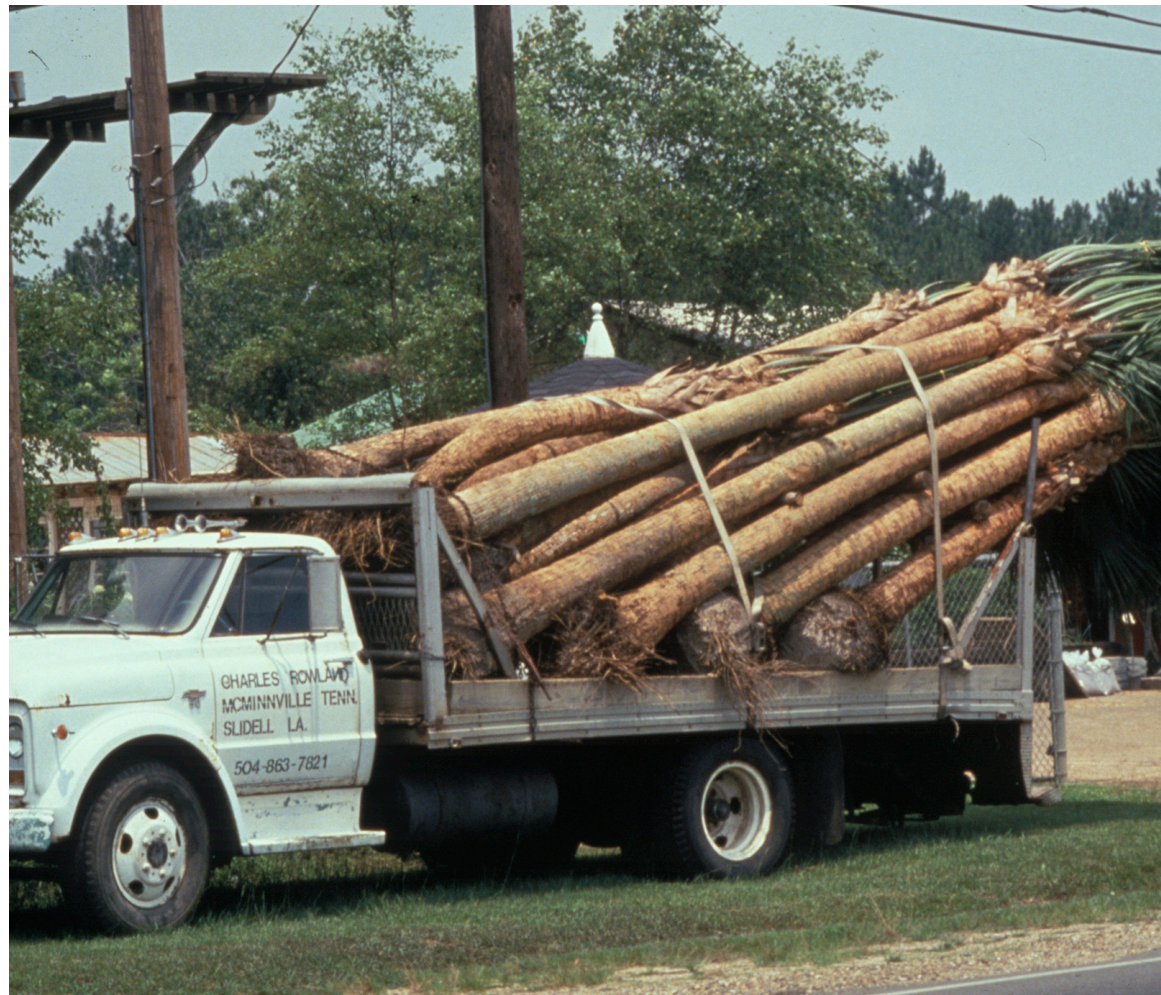
Figure 11 —The new owners of these large palm trees can be confident that they were shipped from a nursery that used an approved treatment for IFA.