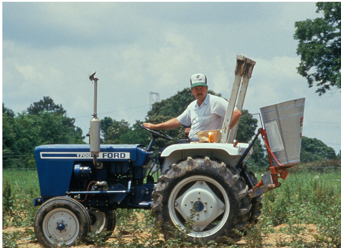
Figure 9 —Field-grown nursery stock can be certified for shipment based on in-field treatments with baits used in combination with granular chlorpyrifos.

Apply bait with any granular applicator capable of applying labeled rates (1.0 to 1.5 lb of bait per acre). Calibration of equipment is essential, and most granular applicators cannot be accurately calibrated. A Herd® GT-77 Granular Applicator (Herd Seeder Co., Logansport, IN) is frequently used in conjunction with all-terrain vehicles or farm tractors to apply fire ant bait.