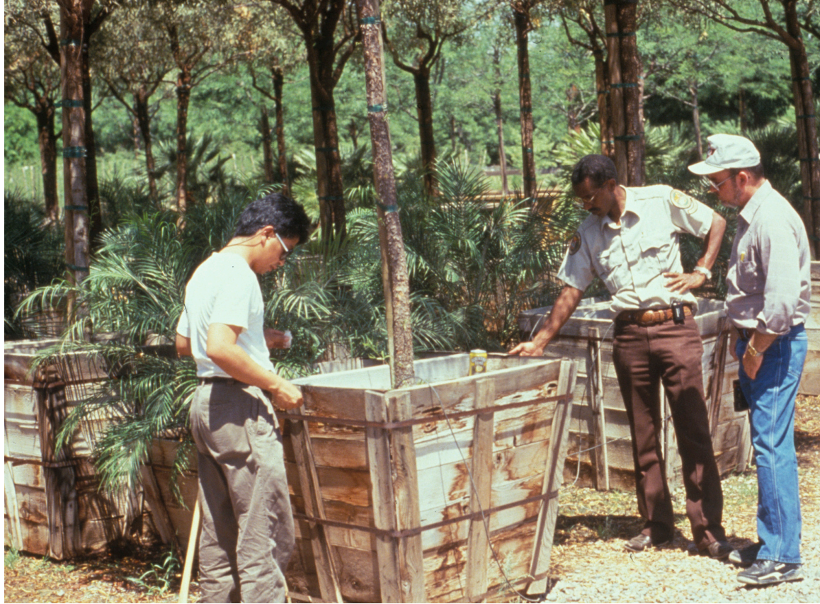
Figure 10 —State plant regulatory officials inspect nursery stock and enforce the Federal IFA quarantine.

2. Control —Nursery plants that are shipped under this program must originate in a nursery free of the IFA (fig. 11). Nursery owners must implement a treatment program with registered bait and contact insecticides. The premises, including growing and holding areas, must be maintained free of the IFA. As part of this treatment program, all exposed soil surfaces (including sod and mulched areas) on property where plants are grown, potted, stored, handled, loaded, unloaded, or sold must be treated with a broadcast application of bait at least once every 6 months. The first application is more effective when applied early in the spring. An early spring bait application provides control before winged queens are produced or have time to establish new colonies. Follow label directions for use.