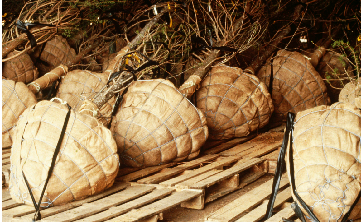
Figure 7 —Prior to being loaded onto pallets for interstate shipping, these balled-and-burlapped trees were immersed in a tank of insecticidal solution to above the soil line to kill any hidden fire ants.

Locate the immersion tank in a well-ventilated place. The location should be covered if possible. Do not remove burlap wrap or plastic containers with drain holes prior to immersion. Immerse soil balls and containers, singly or in groups so that soil is completely covered by the insecticidal solution. Plants must remain in the solution until bubbling ceases. After removal from dipping tank, plants may be placed on a drain board until adequately drained. Thorough saturation of the plant balls or containers with the insecticide solution is essential.