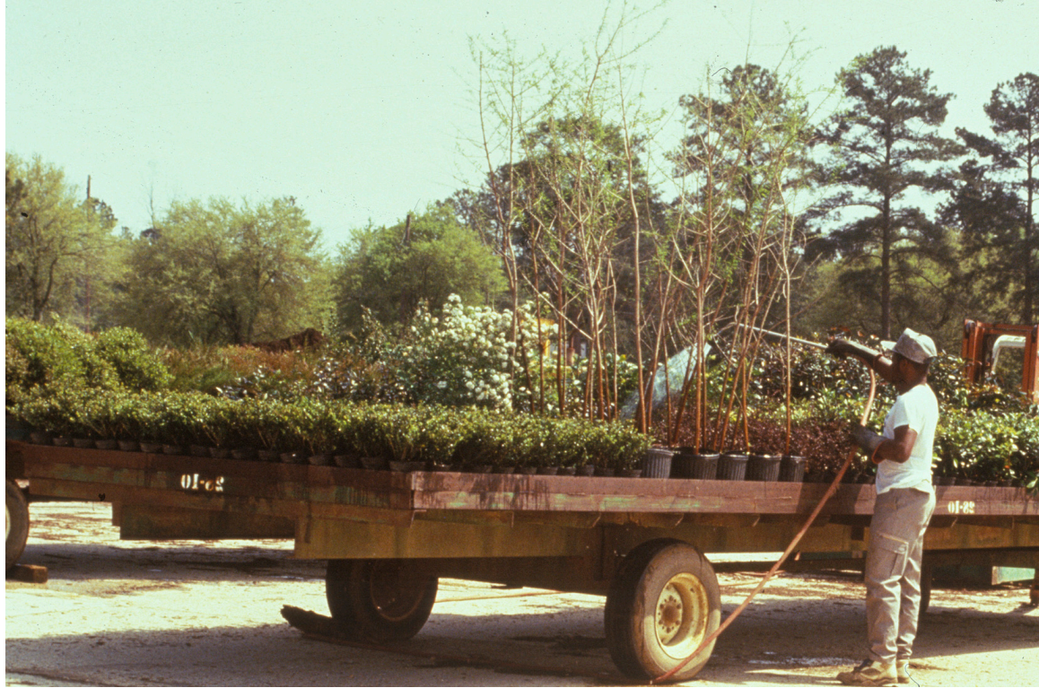
Figure 8 —This nursery worker is drenching containerized plants.