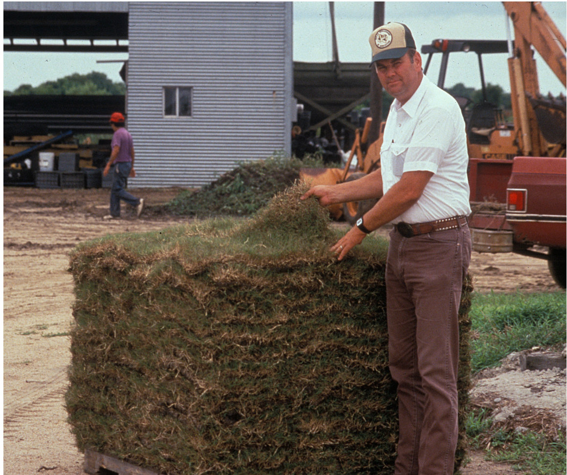
Figure 12 —Grass sod can be infested with newly mated queens as well as entire fire ant colonies.

Procedure —Apply a single broadcast application of chlorpyrifos with ground equipment (fig. 12) or apply two sequential broadcast applications of granular fipronil. Immediately after treatment, apply at least 1.5 inches of water to treated areas.