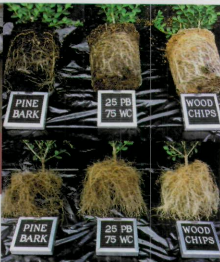
One-gallon Japanese holly — grown for one year in either 100 percent pine bark, 75 percent pine tree substrate (PTS) or 100 percent PTS — all show healthy root systems, often with the most root growth occurring in the wood substrates.