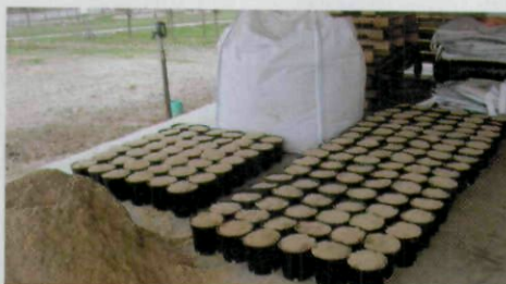
Conceivably, pine trees can be harvested one day then processed into a substrate and potted the next day because no aging or composting of the materials is necessary.

ers was similar for both pine bark and PTS — both around 17 percent. The similarity in shrinkage, despite known higher rates of decomposition in PTS, was due to the increased root volume of the PTS-grown plants, which fills the void left by the decaying wood particles.