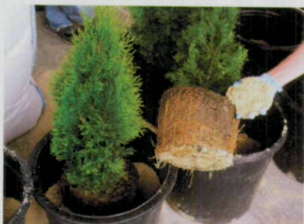
Three-gallon arborvitae were grown from liners in pine tree substrate (PTS), then stepped up to 15-gallon containers and grown for two additional years in PTS.

Studies have showed that the output of PTS produced in a hammer mill with no screen in place would be about 76 kilograms per horsepower-hour (kg/hp-hr) compared to only 16 kg/hp-hr for a hammer mill fitted with a three-sixteenth-inch screen. The lower output for producing a smaller-particle PTS would also likely require a more expensive hammer mill designed to move material (coarse pine