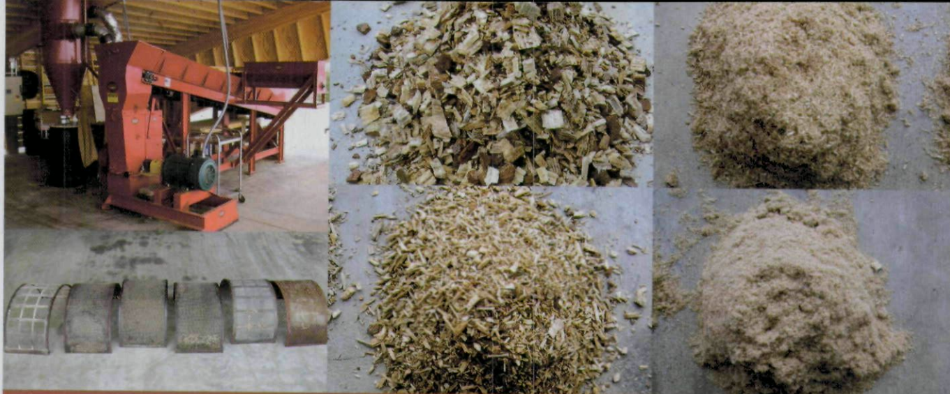
A hammer mill can be fitted with different-sized screens to grind coarse wood chips into any particle size to produce a substrate with physical characteristics similar to pine bark or peat-based mixes.

as a container substrate due to how quickly they decompose and shrink during crop production — a result of the low lignin content in hardwoods. The substrates produced in these studies — conducted in 2006 — were processed with three-sixteenth-inch hammer mill screens to produce small particles that accelerated their decomposition (small particles decompose quickly) in containers and negatively affected plant growth.