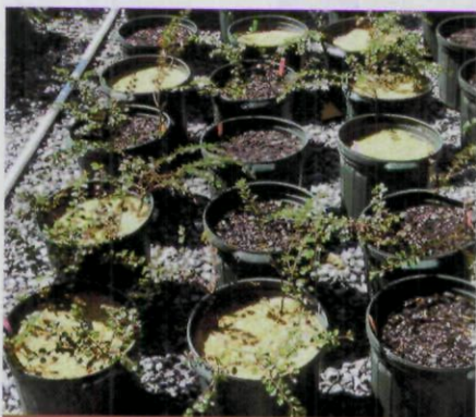
Plants in 5-gallon containers were evaluated for two growing seasons (70 weeks) when grown in pine bark or pine tree substrate under fertilized outdoor nursery conditions to monitor changes in physical properties and substrate shrinkage.

Based on the more current methods of substrate construction (grinding wood to have large particles and amending with other materials for fine particles), it is believed that hardwood species could be viable for use as a substrate component. This is especially true if, for example, hardwood chips are used as 25 percent, 50 percent or even 75 percent replacement/amendment to pine or Douglas fir bark. Some growers in the US have already had success with hardwood substrates. More research with hardwood species is currently underway.