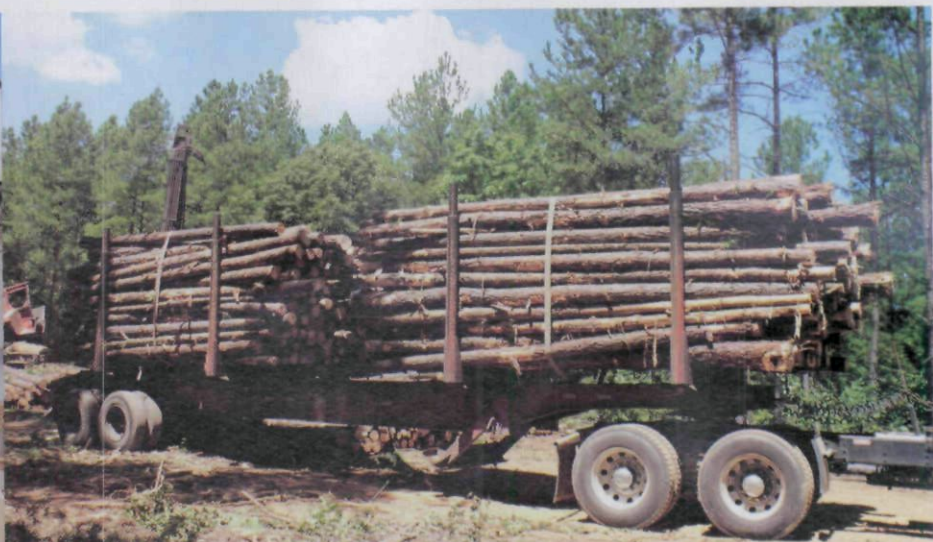
Loblolly pine trees have been harvested and are ready for transport to a processing facility. The pine trees are then chipped and ground in a hammer mill to produce pine tree substrate. The substrate can then be transported, stored or used immediately.

paper production, but pines of any age can be harvested and processed into a substrate. It is even likely that pine plantations could be specifically planted and harvested for substrate production — in other words, nurseries could conceivably grow their own substrate. No composting of PTS is necessary, and the trees can be literally harvested one day and used to pot plants the next day after grinding.