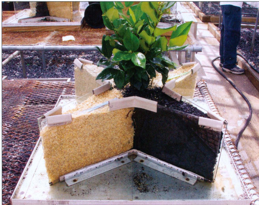
The Horhizotron is used to evaluate root growth of woody shrubs in PTS and pine bark.