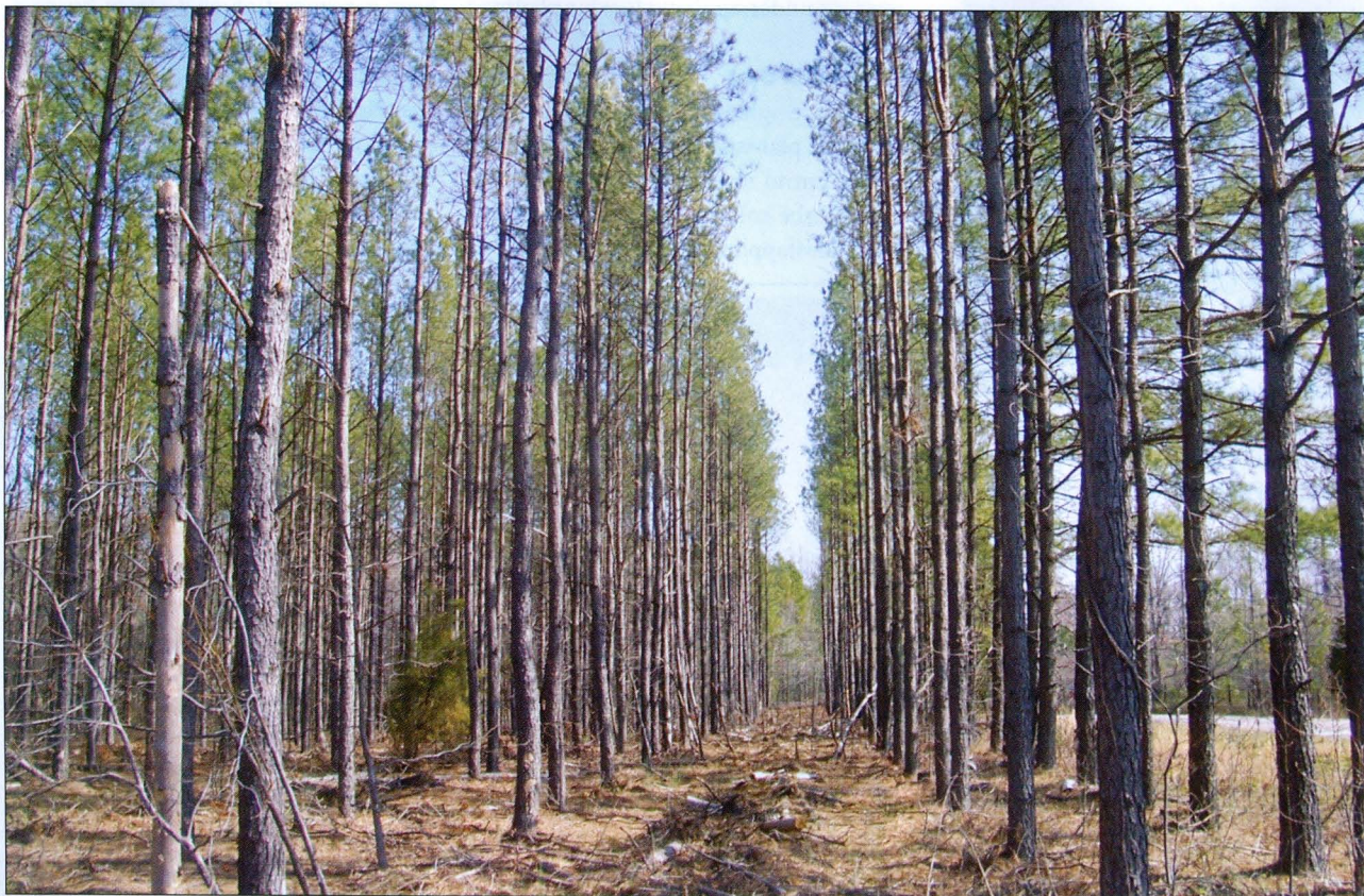
A typical stand of loblolly pine trees. Pine tree substrate can be produced by chipping freshly harvested pine trees and grinding them in a hammer mill.