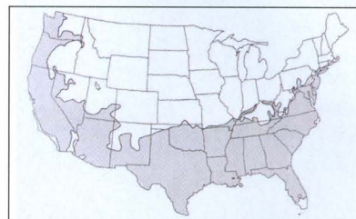
Figure 1: Potential planting range for loblolly pine trees in the United States

PTS is produced by chipping freshly harvested pine trees, which produces wood chips approximately 1 inch by 1 inch by ¼ inch (typical pulp wood chips). Trees can also be ground in other machines such as tub grinders and mulch grinders, which produce shredded wood that