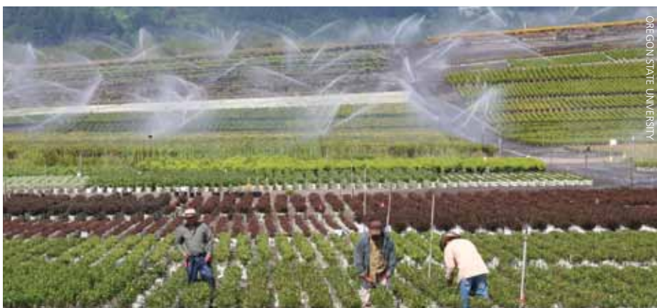
Researchers at Oregon State University have been studying how soilless substrates can be used together with moisture monitoring equipment to get the best results while reducing the need to irrigate.

Researchers are developing monitoring systems that can prevent overwatering and underwatering