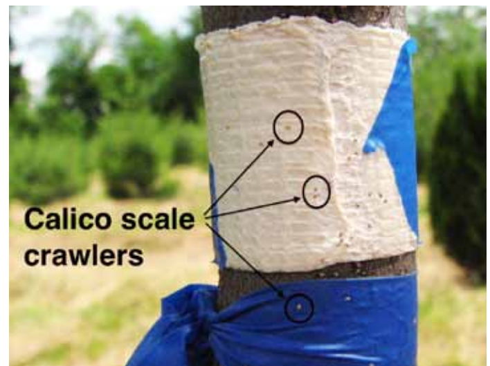
Figure 2. Double-sided tape placed around the trunk above females can detect calico scale crawler emergence.

Overwintering life stage – Acer (Northwood*, 'Legacy'*; Green Mountain* A. campestre *), Celtis * and Zelkova *. Scout for immature second-instar females, which are oval, almost flat in profile, and gray to black. Also, scout for signs of an infestation during the previous season. Look on trunk, especially at nodes and behind stakes for dead adult females on the bark or light-colored round circles where females were attached to the bark. Record presence/absence on 15 plants of each cultivar. http://utuknurseryipm.utk.edu