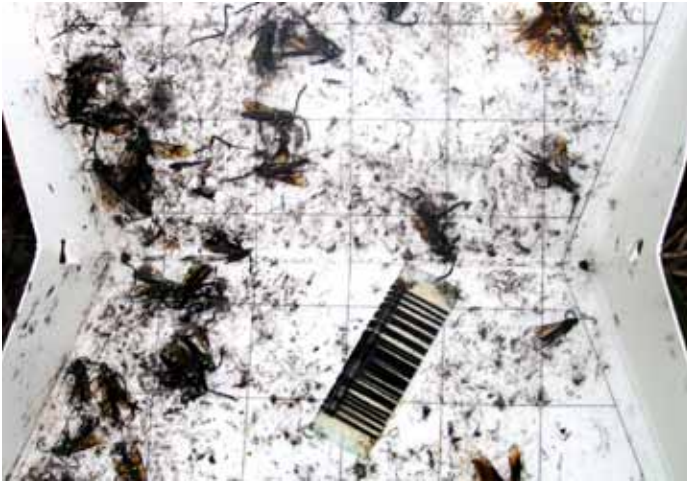
Figure 4. Inside of wing trap with the borers caught in it and the lure.

level in the nursery, but can be placed at the office or other convenient location nearby. Traps can also be hung from limbs of trees in the nursery if duct tape or another protective coating is used to prevent bark damage (Figures 3 and 4). For flatheaded appletree borer, use red sticky traps that mimic a tree-trunk shape (no lure). Use commercially available ultra-high-release lures for granulate ambrosia beetle to better attract the adult beetles. For clearwing borers (e.g., peachtree and lesser peachtree borers) use the commercially available lures (not interchangeable, as they are different isomers). Use one trap per insect species.