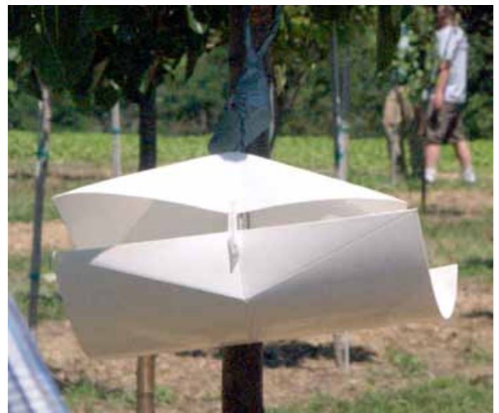
Figure 3. Wing traps with pheromone lures are useful for trapping clearwing moths.

Set traps according to the scouting schedule (Tables 1 and 2). Traps should be hung at 4-6 feet above ground