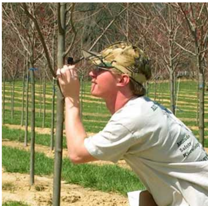
Figure 1. Scout for overwintering maple mites at the branch collar.

Nursery growers indicate that they use IPM practices but some components to IPM are not widely adopted because demonstrated success is needed, IPM takes too much time to implement and nursery-specific IPM information is not readily available (Hoover et al. 2004 and LeBude et al. 2012). Application of IPM to nursery crops is limited, because validated, standardized protocols and corresponding action thresholds have not been published (Adkins et al. 2010, LeBude et al. 2012).